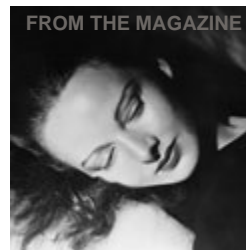
Read M. F. K. Fisher's classic series, An Alphabet for Gourmets .

EXPLORE MORE ON GOURMET.C VIDEO | FIRS TASTE COOKING TI COOKBOOK! CULINARY CULTURE CHEFS | COO EIGHT GREA