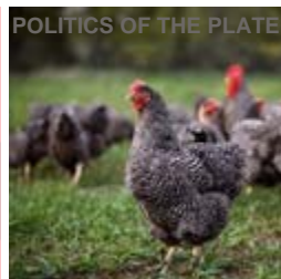
The latest in food politics gets served up every week in Politics of the Plate.

DIARY OF A FOODIE FROM VERMONT TO VIETNAM, TAKE A GLOBAL CULINARY TOUR WITH SEASON THREE OF OUR AWARD-WINNING PUBLIC TELEVISION SHOW, GOURMET'S DIARY OF A FOODIE.